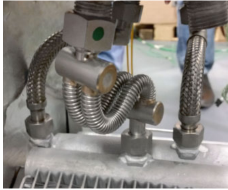
ASSIWELL® all-metal hoses: robust and extremely flexible.

industrial companies in the meals distribution market. Early in the morning, the trolleys will be at the ready so breakfast can be served, and they will remain in service tirelessly the rest of the day, until the last dinner has been brought round and served at the desired temperatures.