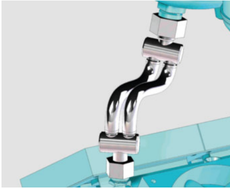
The hose is standard; the fittings have been specifically designed.