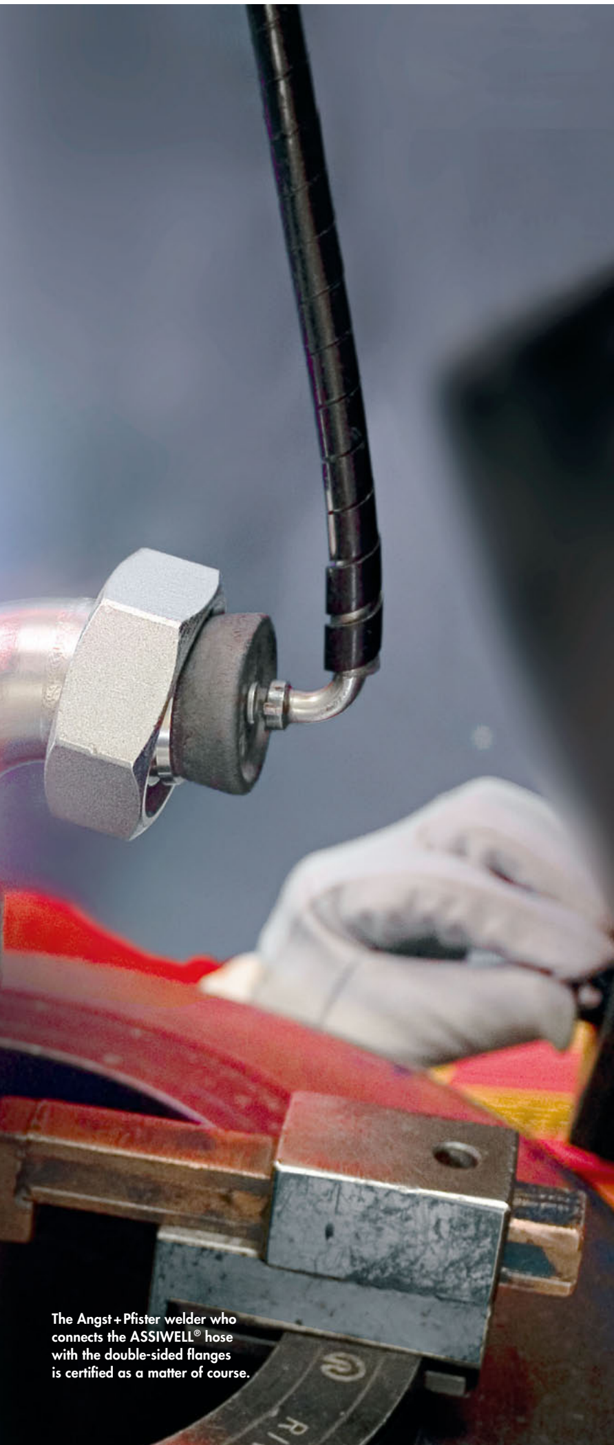
The Angst + Pfister welder who connects the ASSIWELL® hose with the double-sided flanges is certified as a matter of course.

The gear pump comprises two gears of equal size. They interlock and are contained within a housing. ASSIWELL® transports the oil used to cool the gear pump.